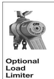
Optional Load Limiter

† Can be supplied with lifts longer than 5 feet