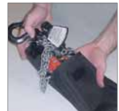
Convenient Carry Bag

Perform just like larger hoists, but small enough to fit in the palm of your hand.