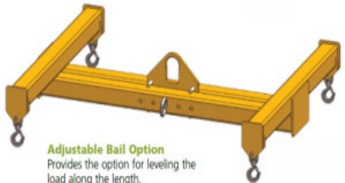
Adjustable Bail Option Provides the option for leveling the load along the length.