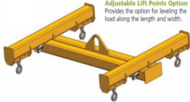
Adjustable Lift Points Option Provides the option for leveling the load along the length and width.