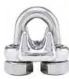
SS-450 (316 Stainless Steel)